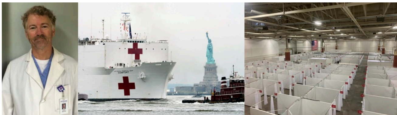
U.S. Senator Rand Paul, an M.D., volunteers at a local hospital after recovering from the coronavirus. The USN Mercy, a hospital ship, sails into New York to deal with the expected flood of patients. An army field hospital sits empty in Wisconsin.

The idea of paycheck protection wasn’t absolutely stupid. At least, not at first. The President’s coronavirus team was asking the American people for 15 days, later expanded to 45 days to “flatten the curve.” The idea was to slow the spread of the disease to give the medical sector time to gear up for the expected flood of sick people. If this plan worked, people could soon return to work, indeed to the very employer for which they worked prior to the shutdown, as paycheck protection meant their employer kept them on the payroll for the short period of the shutdown.