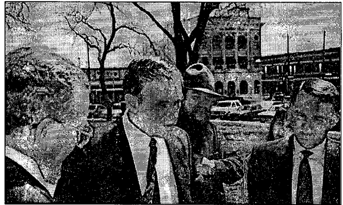
Congressional candidate Ron Paul talks with voters in the final days of his successful primary campaign.

Johnson can be reached at 1030 Longworth HOB, Washington, DC 20515 or samtx03@hr.house.gov.