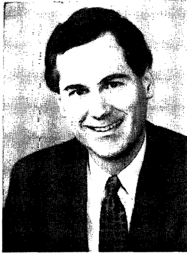
Tom McClintock for U.S. Congress (California, District 24)