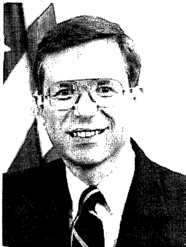
Dick Zimmer for U.S. Congress (New Jersey -District 12)